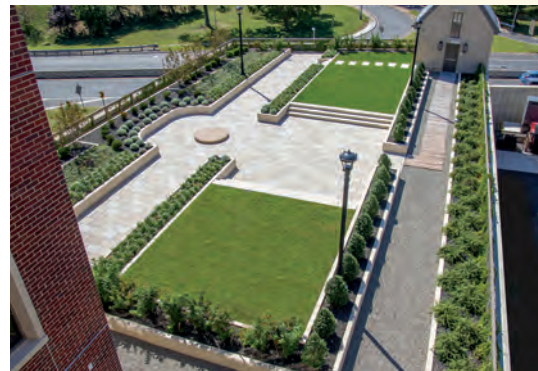
Housed atop the building's parking deck is a green roof that creates an outdoor space for students and University events.