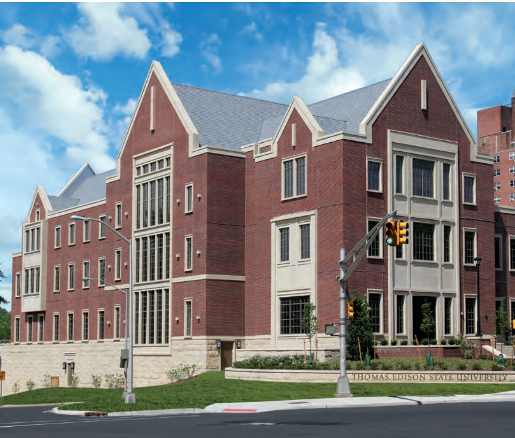
The development of Glen Cairn Hall has transformed a key gateway to Trenton at W. State and Calhoun streets near Route 29.