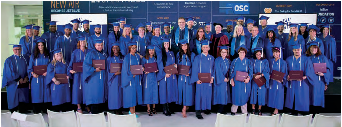
Roughly 50 JetBlue Scholars, pictured, completed their degrees with the University within the first year of the program’s launch.