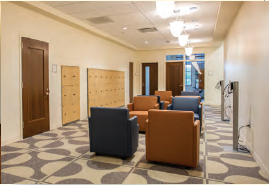
The Nursing Lounge on the second floor of the building features seating, charging stations and lockers, which gives nursing students a comfortable place to congregate, study and socialize.