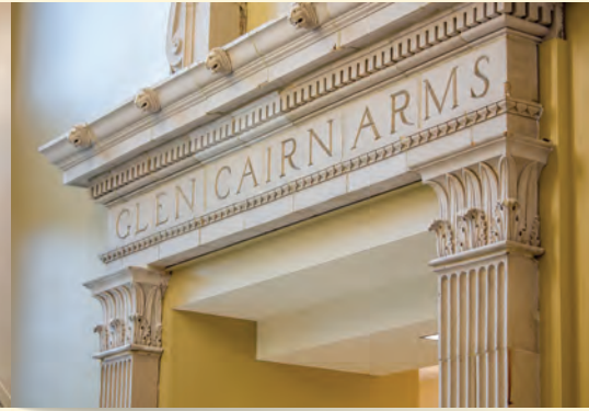
The Glen Cairn Arms apartment complex iconic entryway was preserved, restored and built into the design of the new building, including a piece of history of the site inside the new structure.