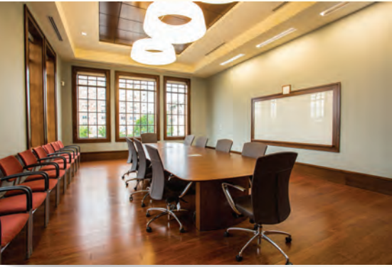
Glen Cairn Hall features a number of conference rooms to facilitate University events and meetings.