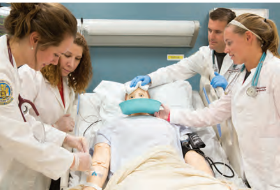
Accelerated 2nd Degree BSN Program students utilize state-of-the-art simulation lab equipment as well as a testing center as part of their curriculum.