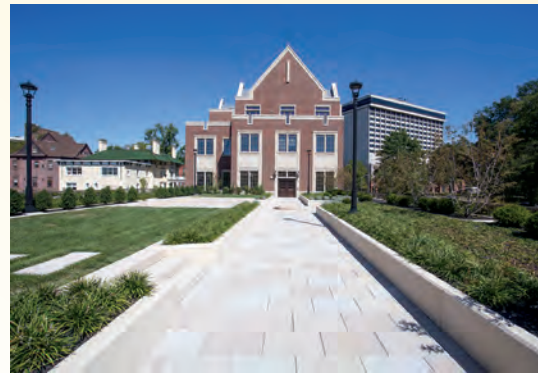
Glen Cairn Hall's green roof, looking toward the back end of the building, helps to reduce the flow of rainwater and mitigate the urban heat island effect.